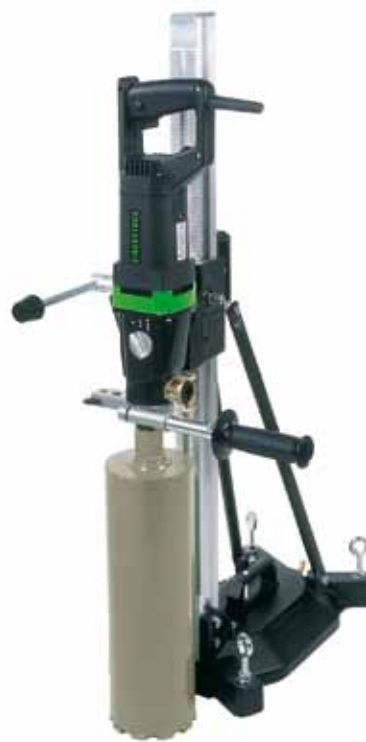
ETN152/3P & BST152 rig