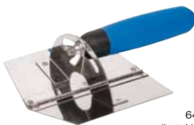
640010 adjustable angle trowel

The corner square is for producing clean internal 90° angles