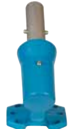
744400 tilting bracket