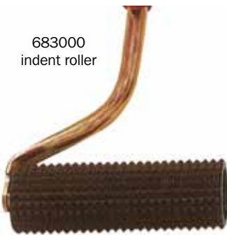
683000 indent roller