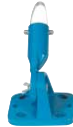
744410 angle bracket

Brackets and handles are ordered separately