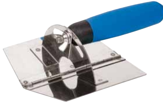
640010 adjustable angle trowel