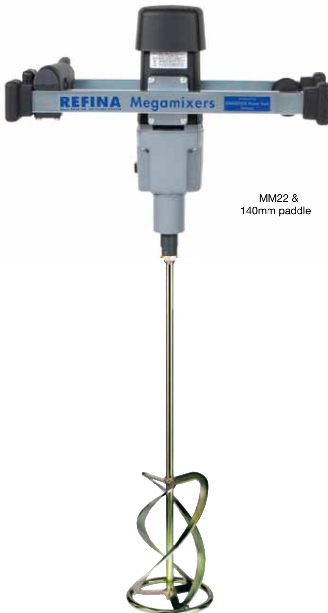
MM22 & 140mm paddle