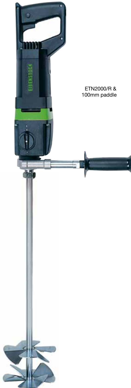
ETN2000/R & 100mm paddle