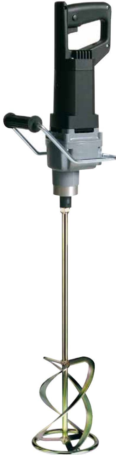
MM29,1 & 160mm paddle