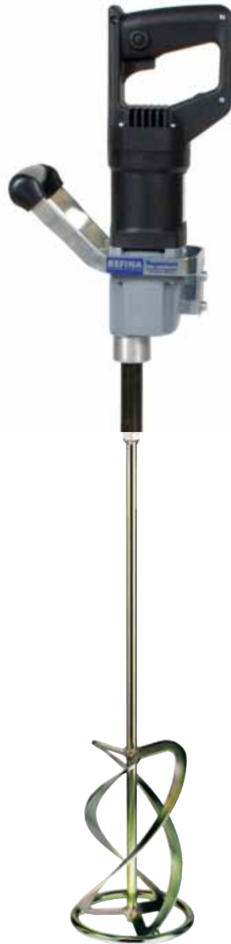
MM19/2 & 120mm paddle