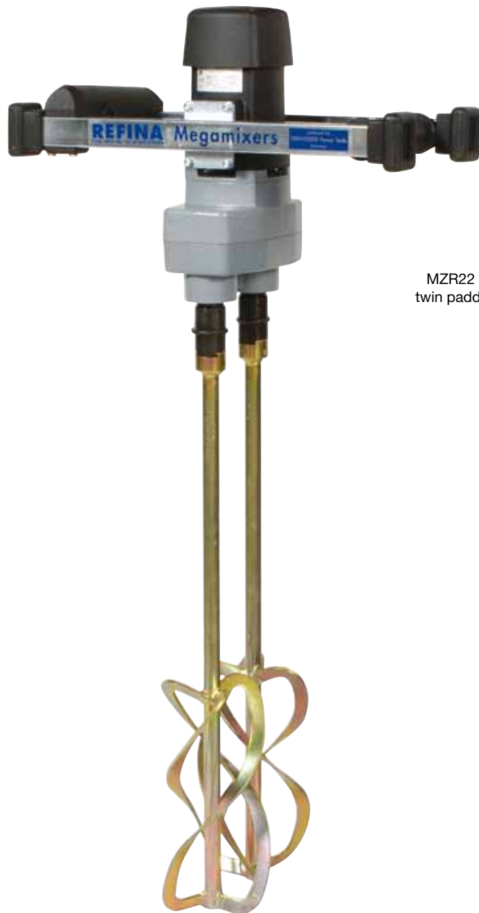
MZR22 & twin paddles