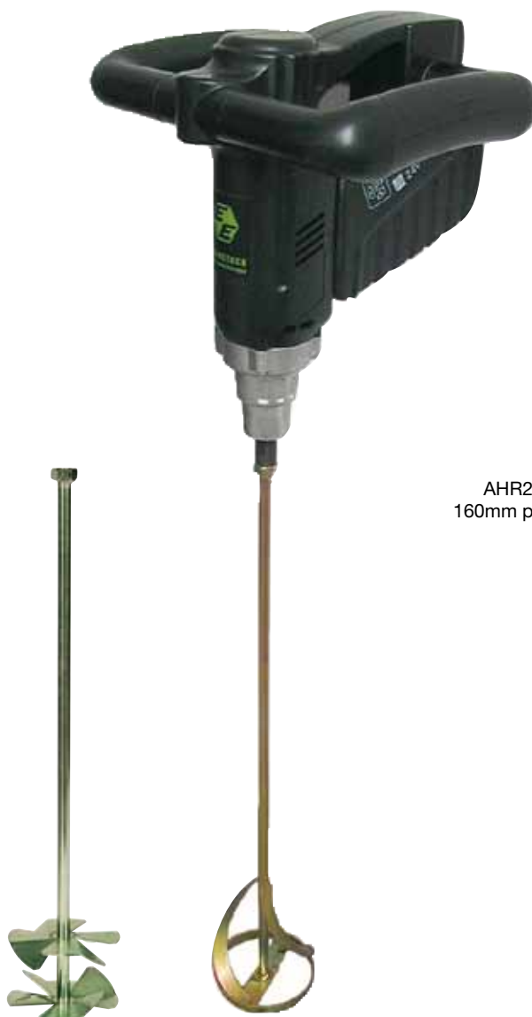
AHR24 & 160mm paddle