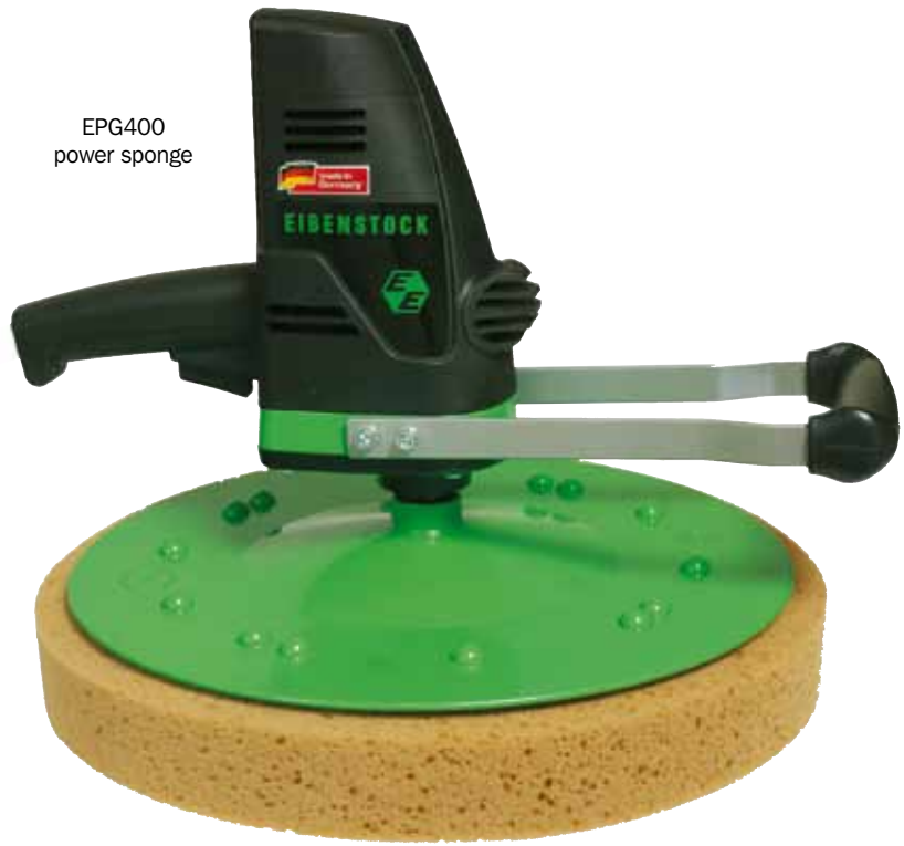
EPG400 power sponge