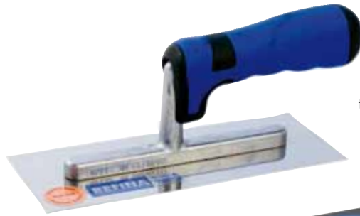
221021 trowel bracket