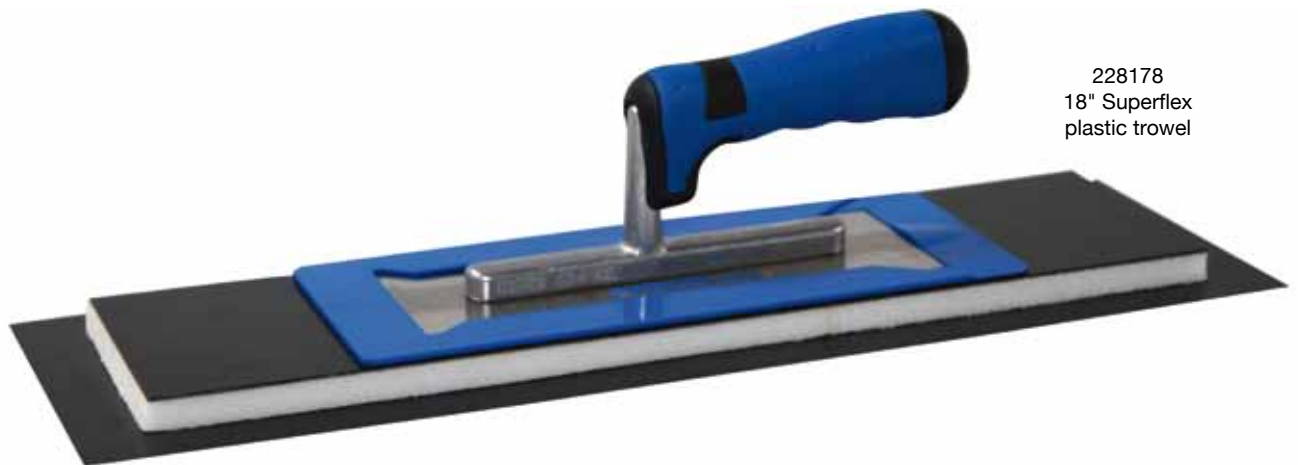
228178 18" Superflex plastic trowel