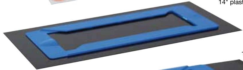
228175 14" plastic blade