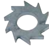
C4 tungsten cutters