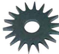
C2 steel cutterd