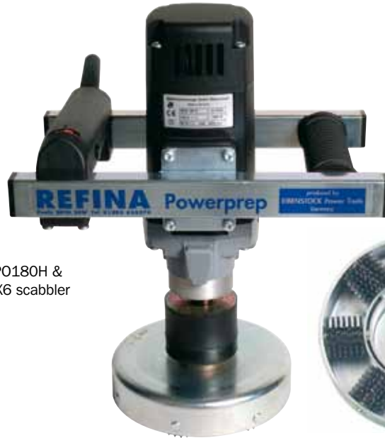
EPO180H & SRX6 scabblers